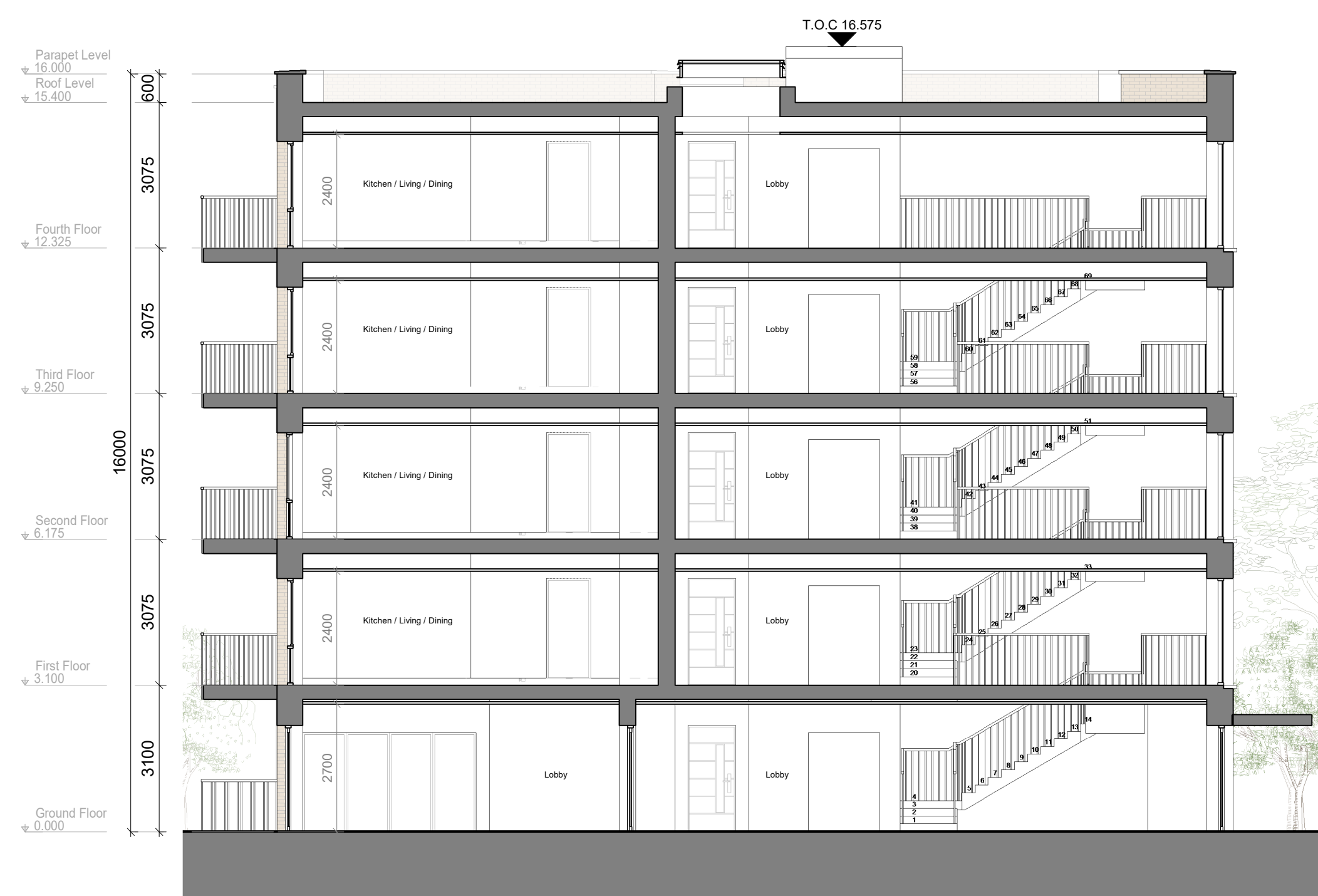
SCALE: 1 : 100